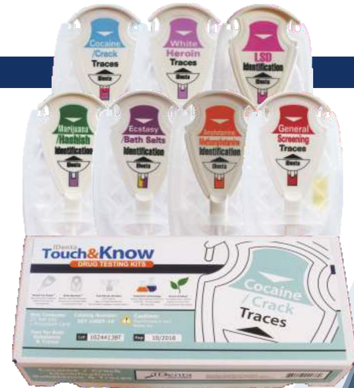
Box of 10 Kits

The first safe and easy to use portable tests specifically designed for use by untrained personnel. The patented design of the Smart-Tip ™ probe allows for safe sampling of a suspected substance. There is no need for physical contact with either the substance or the suspected user. No knowledge of chemistry is required to use Touch&Know ® drug testing kits. All reaction materials are sealed in the reaction chamber at all times, eliminating any safety concerns. Results are color coded for easy reading.